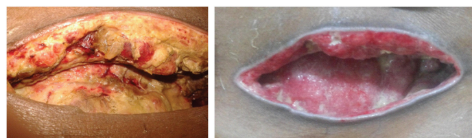
[Table/Fig-2]: Diffuse myonecrosis of abdominal muscles and superficial fascia with avascular necrotic tissue but overlying healthy skin. [Table/Fig-3]: Granulation tissue in the same wound after regular dressing and two debridements.

Keywords: Constipation, Debridement, Myofascitis